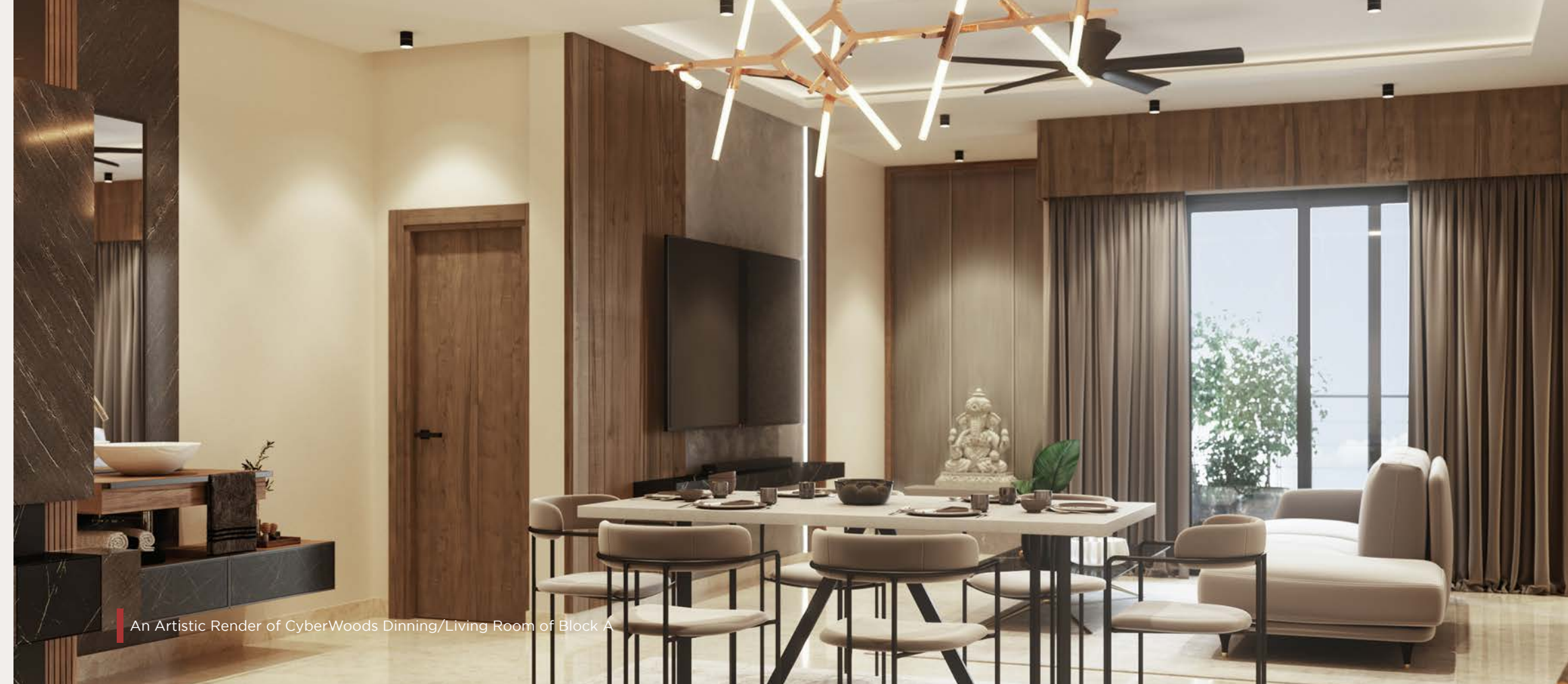
An Artistic Render of CyberWoods Dining/Living Room of Block A

Spacious Lift Lobbies and corridors are present in both the blocks for your service. Designed with elegant natural materials, the lift lobbies are captivating spaces for a sophisticated feeling while you en-route to and fro your apartment.