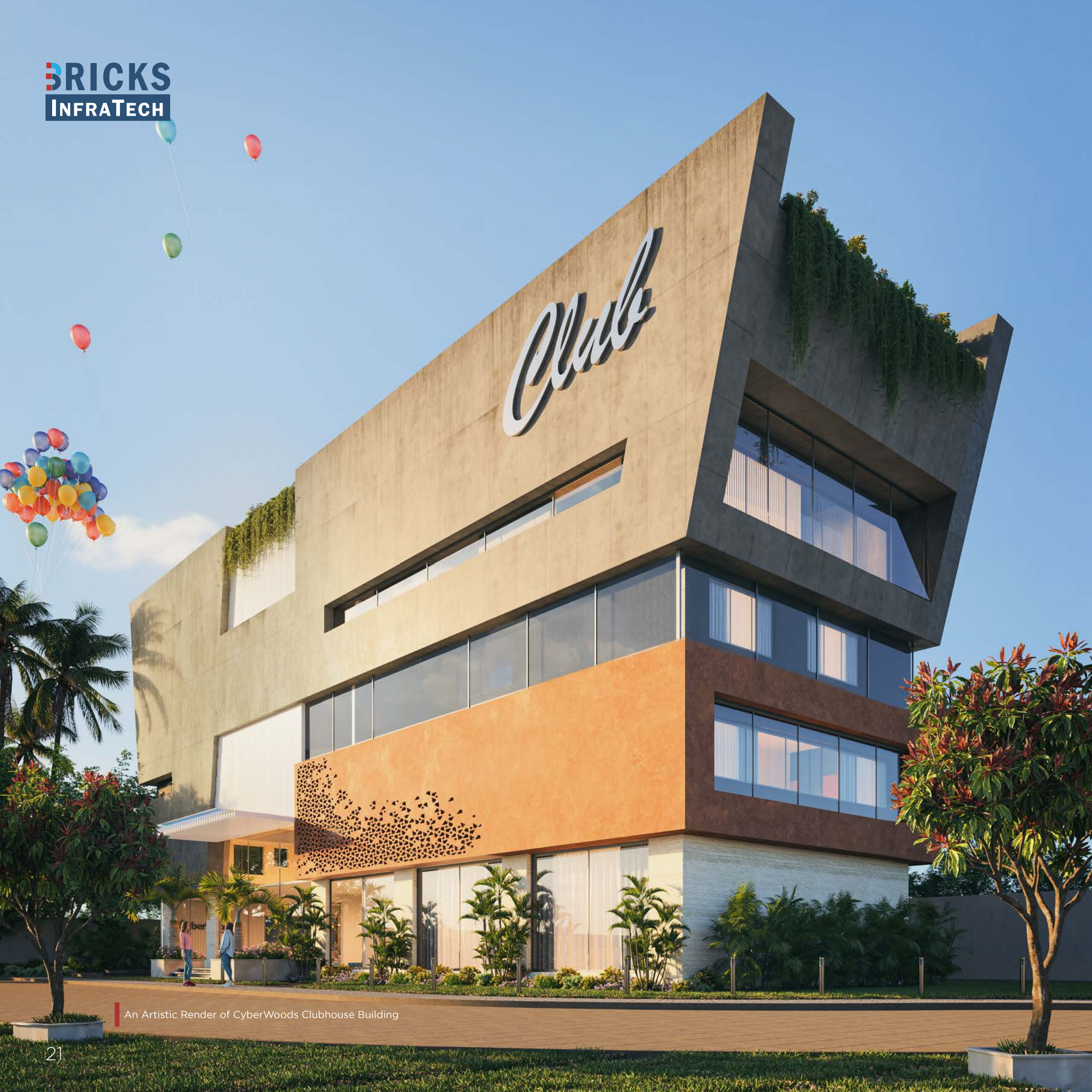
An Artistic Render of CyberWoods Clubhouse Building