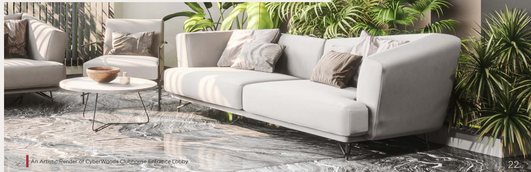
An Artistic Render of CyberWoods Clubhouse Entrance Lobby

Keeping luxury and leisure in mind, the 5 level Club House is equipped with multiple amenities for the residents. With over 16,000 sq. ft. of floor area, the Club House boasts different luxurious features to suit the needs of the residents. Multiple fitness centers, multipurpose halls, indoor games, open-air barbeque deck, and pools are some of its unique highlights.