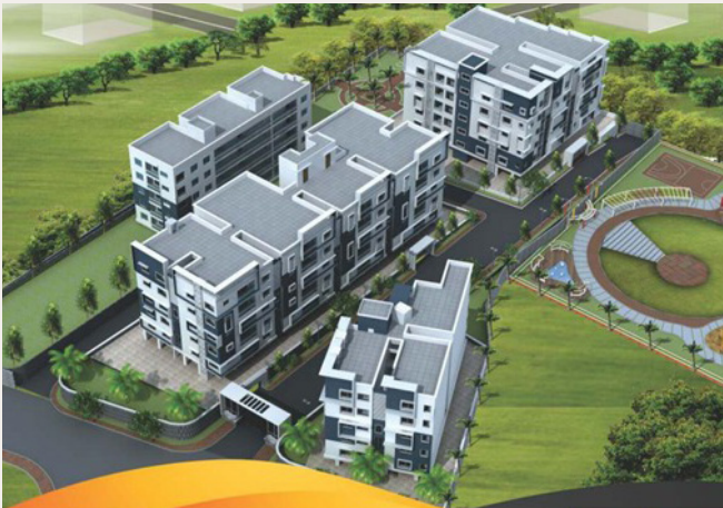
Bricks - Opera, Secunderabad