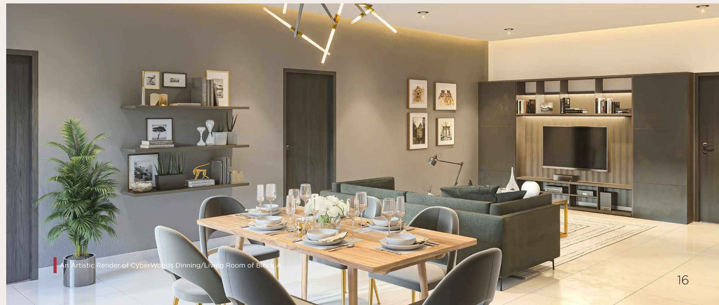
An Artistic Render of CyberWoods Dining/Living Room of Block A