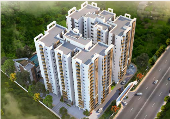
Bricks - Skywoods, Gopanapally