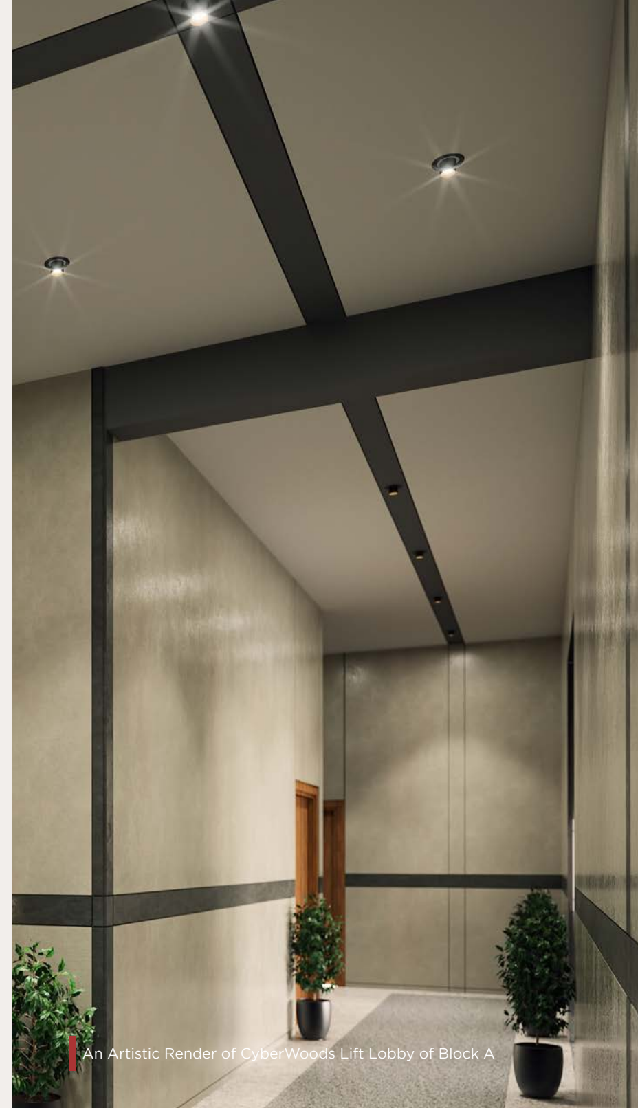
An Artistic Render of CyberWoods Lift Lobby of Block A