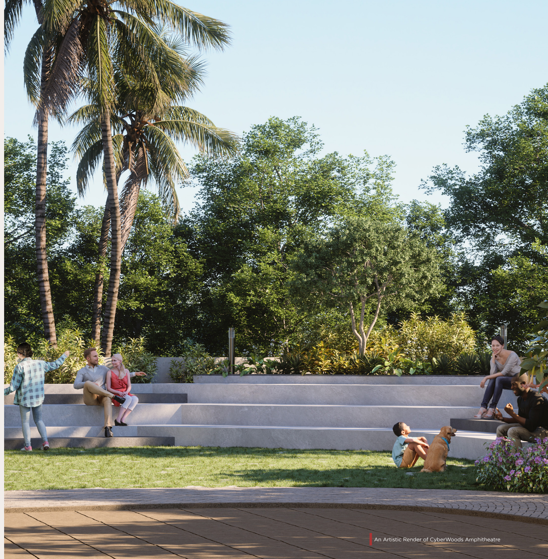
An Artistic Render of CyberWoods Amphitheatre